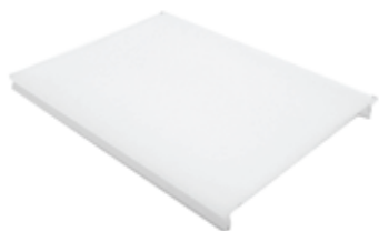
PC Cover Diffuser