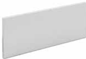
Aluminum End Caps