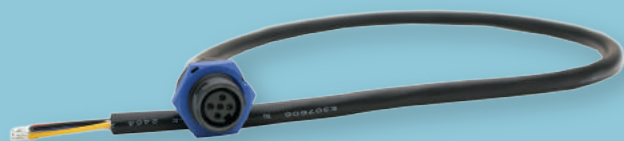
5-Pin Female DC Connector